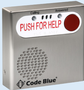
IP2500-s Single button surface mounted