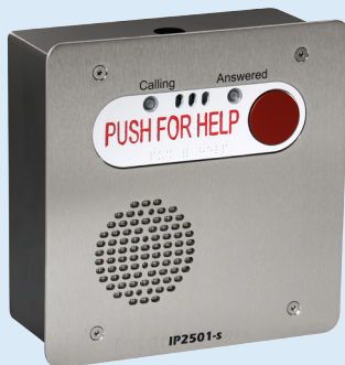
IP2501-s Single button flush mounted with mounting box