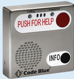
IP2500-d Dual button surface mounted