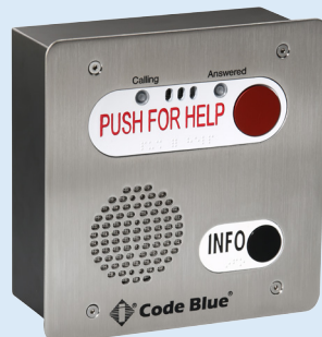
IP2501-d Dual button flush mounted with mounting box